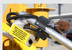
Horn button on wand