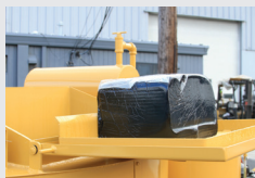
Anti-Splash Material Loading Hatch