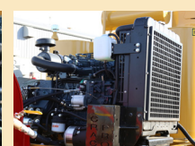
V1505 Kubota Diesel Engine