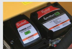
Diesel fired Beckett Burner