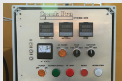
Digital Control Center with protective steel cover