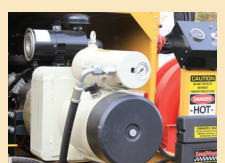
Direct Drive Air Compressor