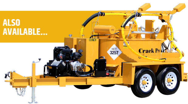
TR 260 Double Pump now available!