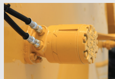
Direct-Drive FWD/REV Full Sweep Agitation