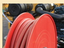
100' x 5/8" Reeled Hose & Wand