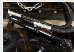
Hydraulic Shift for Angling the Squeegee