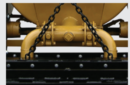
Dual Easy-Open Butterfly Sealer Discharge Valves