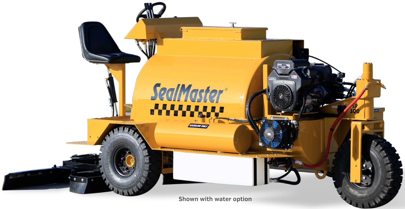
Shown with water option