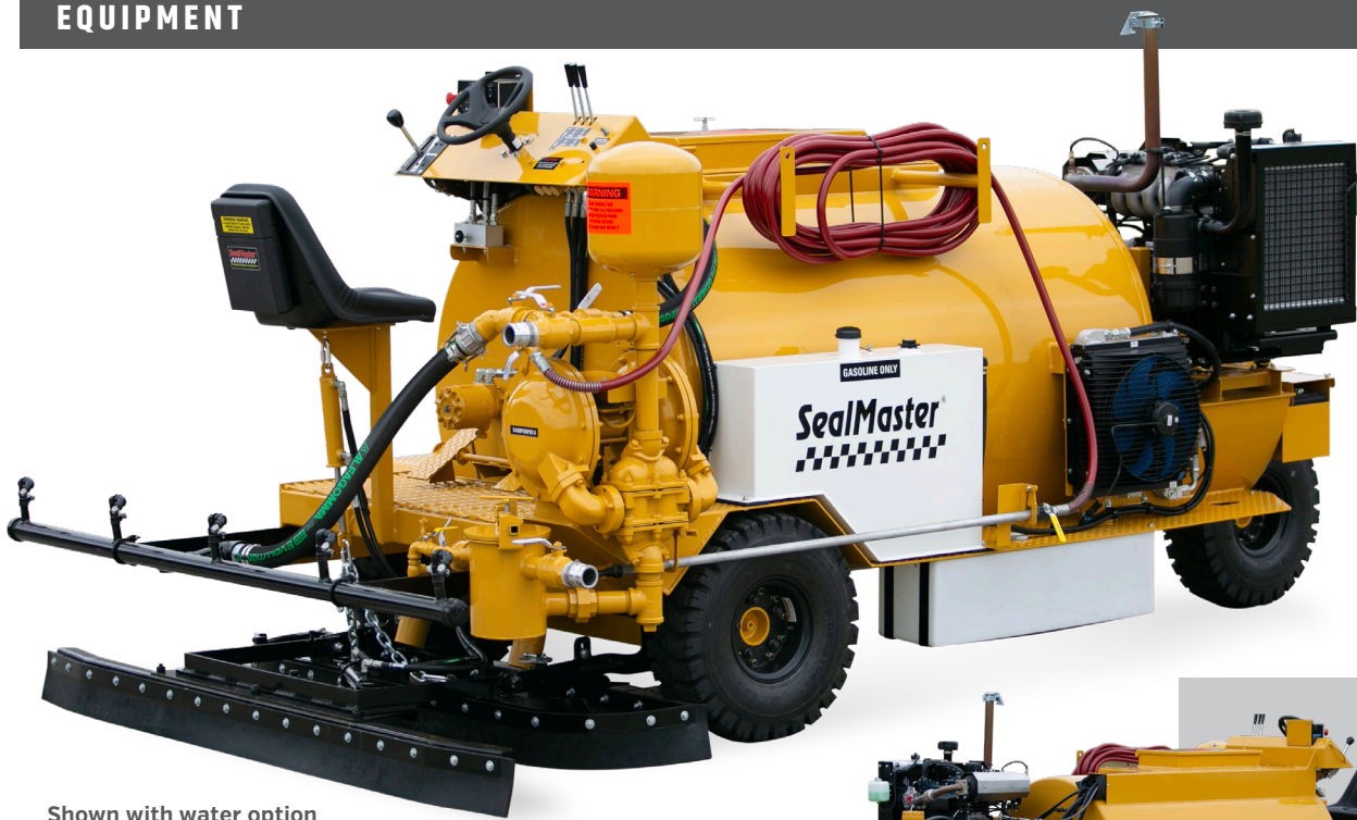
Shown with water option